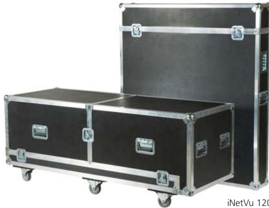
iNetVu 1200 2-Case, 1-Piece Reflector