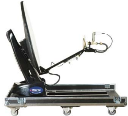
iNetVu 980 Case