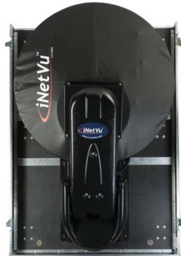
iNetVu 980 Case